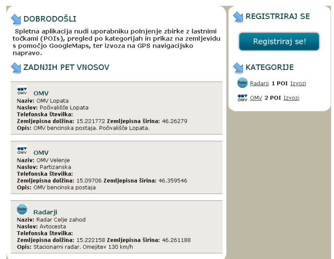
Figure 3: Web application basic (intro) page.

Table UPORABNIKI (Users) contains records of all registered users. Foreign key field Status is linked via an id number to table STATUSI (Status) which stores information on user types. Presently only two types of users are planned: a regular user and an editor. The users table is also linked to tables POIS and KATEGORIJE (Categories) via foreign keys, which enables us to retrieve any information about users and their activities.